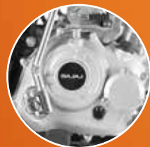
POWER 12 HP

L x W x H 2016mm x 740mm x 1055mm Wheel Base 1285mm Kerb Weight 123 kg